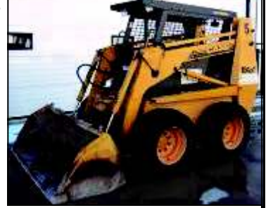
1999 Case 1845C Skid Loader 2682 Hrs.; 6' Bucket