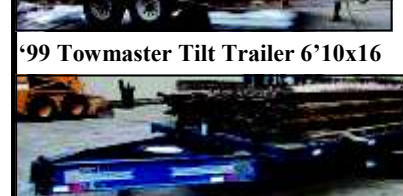
'99 Towmaster Tilt Trailer 6'10x16