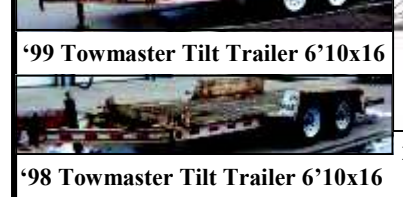
'98 Towmaster Tilt Trailer 6'10x16