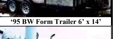
'95 BW Form Trailer 6' x 14'

Descriptions contained herein were provided by the Seller(s). Hagedorn Auction makes no warranty as to the accuracy of this listing or these descriptions. Statements made sale day take precedence over all printed material. All merchandise and/or livestock always sold "as is". Any warranties are strictly between the buyer and seller. A valid drivers license or state ID is required to obtain a buyer's number, NO EXCEPTIONS. We accept cash or PRE-APPROVED checks. If planning to purchase more than $5000 by check please submit a bank letter of GUARANTEE. Attend at your own risk. Hagedorn Auction Co, its owners & employees, are not responsible for any injury, accident or theft. PLEASE CALL OR VISIT OUR WEBSITE FOR COMPLETE TERMS & POLICIES.