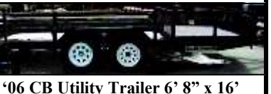
'06 CB Utility Trailer 6' 8" x 16'