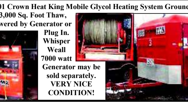
2001 Crown Heat King Mobile Glycol Heating System Ground Heater 13,000 Sq. Foot Thaw, Powered by Generator or Plug In. Whisper Weall 7000 watt Generator may be sold separately. VERY NICE CONDITION!