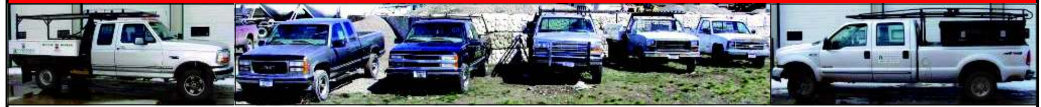
'97 Ford F250, 460, 4x4, Auto, 157K miles '98 GMC 4x4 350 Auto 167K m, '89 Chevy 3/4T Auto 2WD 209K m, '95 Ford F350 Powerstroke 5spd '99 Ford F350 Powerstroke Auto 4x4, 303K miles 118K m, '81 Ford F350 460 Auto w/ NICE flatbed & rack!, '97 Chevy 3/4T 454 Auto 181Km.

PRE-APPROVED BANK LETTER OF GUARANTEE REQUIRED TO PURCHASE EQUIPMENT & TRUCKS BY PERSONAL OR BUSINESS CHECK. CALL US TODAY.