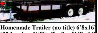
Homemade Trailer (no title) 6'8x16' '85 Lowboy Utility Trailer 8'6" x16'