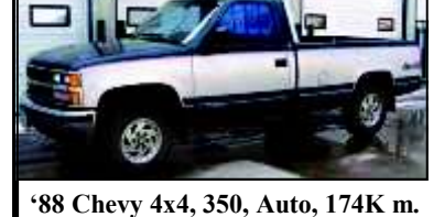
'88 Chevy 4x4, 350, Auto, 174K m.