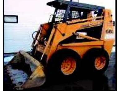
2000 Case 1845C Skid Loader 2571 Hrs.; 6' Bucket w/ teeth