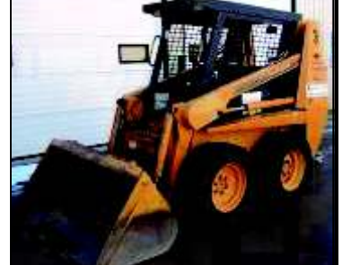
2000 Case 1840 Skid Loader 1933 Hrs.; 5'4" Bucket