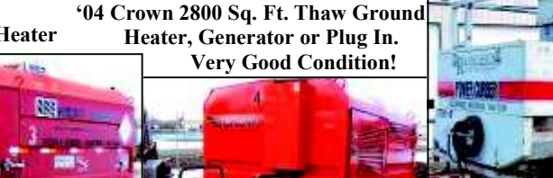
'04 Crown 2800 Sq. Ft. Thaw Ground Heater, Generator or Plug In. Very Good Condition!