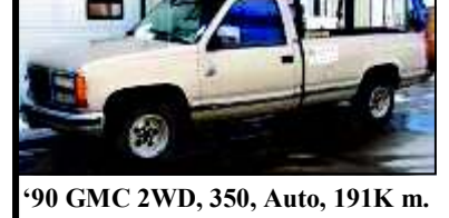
'90 GMC 2WD, 350, Auto, 191K m.