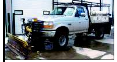
'97 Ford F350, 460, 89K m w/Plow!