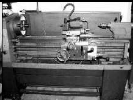
13" Colechester Clausing Lathe 8000 w/hi-spd thread atch, 40" ctrs, 220 3ph