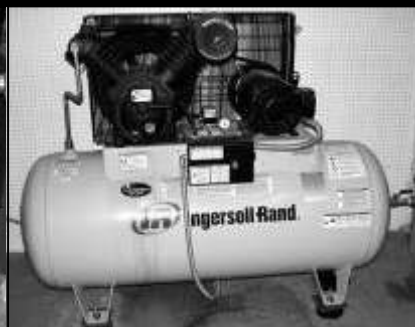
Ingersoll-Rand Air Comp T30 2545 2 stg, 10hp, 35cfm, 120gal, 220 3ph