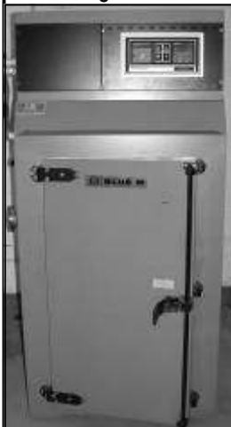
Blue M Indstrl Oven int. 24" w x 24" d x 48" h st. steel, ext. 52x40x84 208/240 3ph, 600 deg f