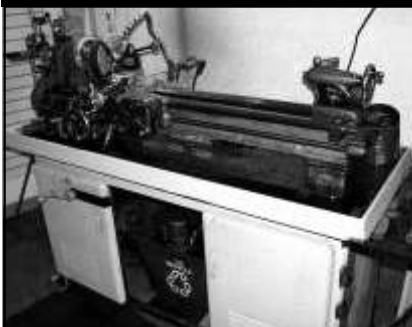
Southbend 10" Chambering Lathe 10" swing, 30" centers, 220 3phase

EQUIPMENT SELLS @ APPROX. 2:30 PM! NO RESERVES! EVERYTHING GOES!