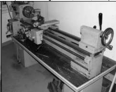
14" Clausing Metal Lathe 6900 Series 48" between centers, 220v 3phase