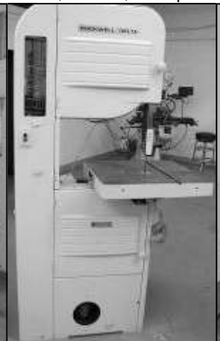
Rockwell Delta Vert. Saw 19.5" throat, 12" h, 220 3ph