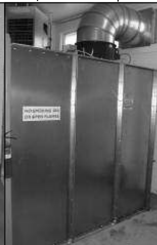
Col-Met Ind. Spray Booth 6' w x 5' d x 7' h, 4 tube light open front, 24" tube axial exhst fan, 18ga galv const