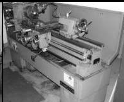
Nardini Engine Lathe MS1440E 13" swing, 32" ctrs, 29" hsl, 220 3ph