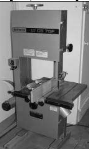
Hitachi Band Saw CB75F 15.5" throat, 1" & 3" blades