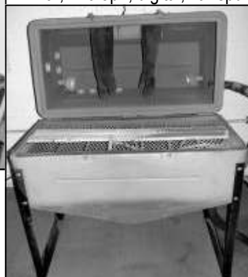
Polymer Clam Shell Cabinet Sandblaster 28"x48" work area