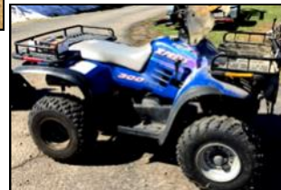
Polaris Xpress 300 4x4 ATV 4-Wheeler