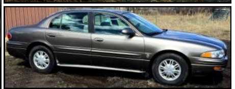
2003 Buick LeSabre FWD—Runs. Has like new snow tires & good set regular tires