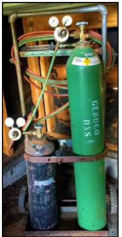
Acetylene Torch w/ Bottles & Cart