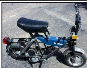
DeBlasi Foldable Gas Scooter—Runs & Comes w/ Tote Bag!

MISC FARM & RANCH EQUIPMENT —Hay Truck 8-Pack Hay Picker; Vintage Ford 8N Tractor w/ Bucket; 2 Bottom Disc Drag; Irrigation Hose w/ Rainbird Sprinkler Heads; 23 Very Good Condition Metal Livestock Corral Panels; Misc Wood Posts & Lumber; Scrap Metal; Electric Fencing; 2 Boxes Baling Twine; Tarps; More. TOOLS, SHOP & YARD EQUIPMENT —John Deere & Ranch King Riding Lawn Mowers (JDere has grass collector); Miller Thunderbolt Constant Current AC Arc Welder on Cart; Acetylene Torch w/Bottles; Lg 12 Speed Heavy Duty Drill Press; Jumper Cables; Chainsaw; Hedge Trimmers; Large Dual Bench Grinder; Large Bench Vice; Variety Yard & Garden Tools; 2 Lg Super Soaker Water Guns; Car Ramps; Tree Pruner w/ Extension; Lg Metal Mail Box; Sm Propane Tank; Variety Power & Shop Tools; Jacks; Antique Frigidaire Air Compressor; Puma ISO9001 Industrial Shop Air Compressor; 23' Aluminum Extension Ladder & More! HORSE & BACK COUNTRY PACKING EQUIPMENT —2 Wooden Sawbuck Pack Saddles; 2 Sets of Canvas Panniers; 1 Set Wood Kitchen Panniers; Lot Misc Horse Tack: Bits, Bridles, Breast Collar, Straps, Saddle Pads, etc; Wall Tent; Collapsible Wall Tent Wood Stove "Simms Wyoming"; Horse Shoeing Tools including very nice Mechanicle Nippers; Curry Combs & More! HOUSEHOLD, GERIATRIC & MISC. PERSONAL ITEMS —