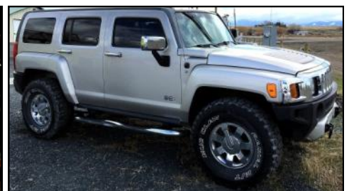
2008 H3 HUMMER—4X4, -50 Miles on New GM Motor! 139K Miles Overall, Runs Great, Good Tires. Clean, Lady Driven.

MISC FARM & RANCH EQUIPMENT —Hay Truck 8-Pack Hay Picker; Vintage Ford 8N Tractor w/ Bucket; 2 Bottom Disc Drag; Irrigation Hose w/ Rainbird Sprinkler Heads; 23 Very Good Condition Metal Livestock Corral Panels; Misc Wood Posts & Lumber; Scrap Metal; Electric Fencing; 2 Boxes Baling Twine; Tarps; More. TOOLS, SHOP & YARD EQUIPMENT —John Deere & Ranch King Riding Lawn Mowers (JDere has grass collector); Miller Thunderbolt Constant Current AC Arc Welder on Cart; Acetylene Torch w/Bottles; Lg 12 Speed Heavy Duty Drill Press; Jumper Cables; Chainsaw; Hedge Trimmers; Large Dual Bench Grinder; Large Bench Vice; Variety Yard & Garden Tools; 2 Lg Super Soaker Water Guns; Car Ramps; Tree Pruner w/ Extension; Lg Metal Mail Box; Sm Propane Tank; Variety Power & Shop Tools; Jacks; Antique Frigidaire Air Compressor; Puma ISO9001 Industrial Shop Air Compressor; 23' Aluminum Extension Ladder & More! HORSE & BACK COUNTRY PACKING EQUIPMENT —2 Wooden Sawbuck Pack Saddles; 2 Sets of Canvas Panniers; 1 Set Wood Kitchen Panniers; Lot Misc Horse Tack: Bits, Bridles, Breast Collar, Straps, Saddle Pads, etc; Wall Tent; Collapsible Wall Tent Wood Stove "Simms Wyoming"; Horse Shoeing Tools including very nice Mechanicle Nippers; Curry Combs & More! HOUSEHOLD, GERIATRIC & MISC. PERSONAL ITEMS —