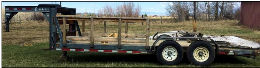
2006 CIRCLE-D 20'x6'8" FLATBED (28' total including gooseneck) CAR HAULER Tandem Torsion Axels, New Tires Brakes, Bearings & Wiring, Ramps & Stabilizers. Nice Trailer!

Diesel, 4-Wheel Drive, Bucket, Snow Plow, Rear 3Pt Hitch, Front & Rear Hydraulics, Hydrostatic, Air Conditioned & Heated Cab. Like New w/ Only 300 Hours! Always Kept in the Barn!