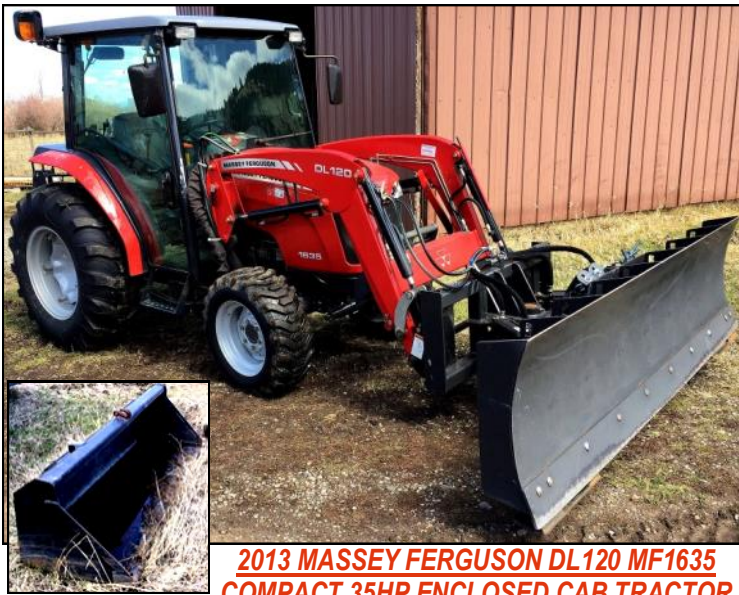
2013 MASSEY FERGUSON DL120 MF1635 COMPACT 35HP ENCLOSED CAB TRACTOR