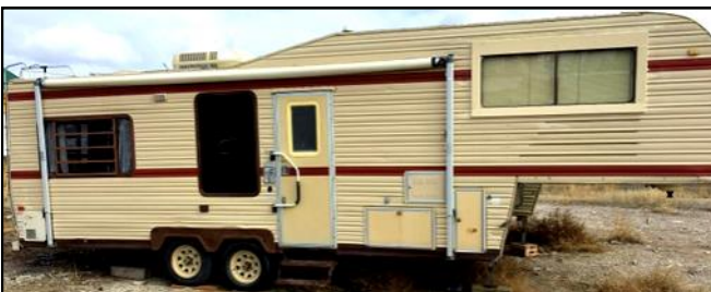
1986 VERY CLEAN 5TH WHEEL TRAVEL TRAILER GOOD CLEAN CONDITION!