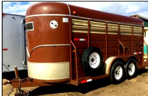
16' BP Stock/Horse Trailer w/Center Gate, Side & Rear Escape Doors, Very Good Tires, Rubber Mats, Good Lights, Brakes