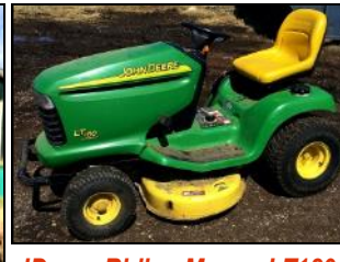
JDere Riding Mower LT180 Auto, 17hp, 42" Cut. Runs!